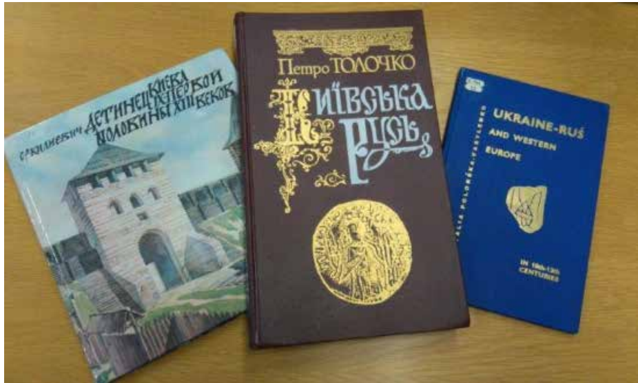
Books about Kyivan Rus' and Kyiv from the British Library's collections.

The church has been the object of research for almost 400 years and can still be seen today in graphic reconstructions and in the findings of archaeological excavations, continued today by the Institute of Archaeology at the National Academy of Science of Ukraine.