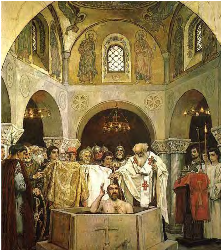
Baptism of the Holy Prince Volodymyr. Fragment of the fresco by V.M Vasnetsov, St. Volodymyr's Cathedral in Kyiv.

This year marks the 1020th anniversary of the completion and consecration of the first stone-built church in the state of Ukraine-Rus', the Church of the Dormition (better known as the Church of the Tithes) in Kyiv. This church was built by Grand Prince Volodymyr to replace the principal pagan sanctuary – the shrine of Perun – and symbolised the transition of Rus' to Christianity and the consequent recognition of the Kyivan state by the Christian world.