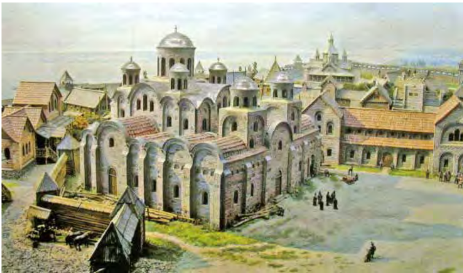
Central part of the 'City of Volodymyr', with the Church of the Dormition. Reconstruction from the Museum of the Institute of Archaeology of the National Academy of Science of Ukraine.

The church contained the relics of saints – Pope Clement I and his disciple Phoebus – which Volodymyr had also brought from Chersonesus. Here, too, he brought the sarcophagus of his grandmother, Princess Olha. In front of the church there was a square, where Volodymyr placed four 'copper shrines' (possibly ancient altars) and copper figures of horses which had formerly adorned Chersonesus. Situated in the very heart of Volodymyr's seat of power, the Church dominated not only the Upper City of Kyiv, but also the lower area, known as the Podil, and enhanced the ancient capital by its remarkable beauty.